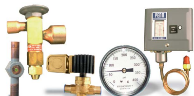
REFRIGERANT COMPONENTS ... All refrigerant components used in Advantage chillers are selected for historic reliability and performance. Components include high & low pressure limit switches, expansion valve, relief valve, filter dryer and sight glass/moisture indicator.