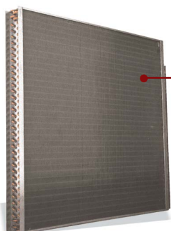
AIR-COOLED CONDENSER ... Finned tube condensers are used in all models. Propeller fans are standard.

RUGGED COMPRESSORS ... Reliable scroll and digital scroll and reciprocating compressors provide long life and energy efficient operation.