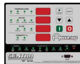
Sentra HE instrument

The SENTRA SK and REGAL RK instruments are available with optional second setpoint capability. The second setpoint is activated by a contact closure between the red and black wires on the remote cable. The remote adjustable setpoint is activated by the input of 0-6 volts.