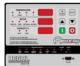
Regal HE instrument