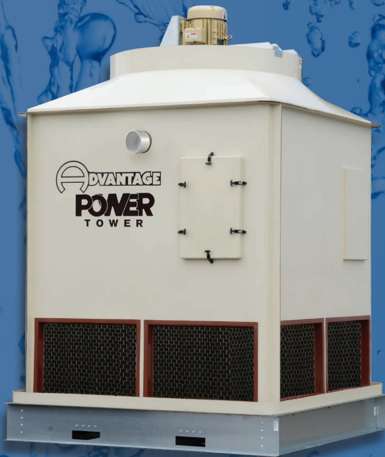
135 Ton Power Tower ® G3 Series

Under design conditions about 1% of the water flow rate evaporates to achieve the cooling affect desired.