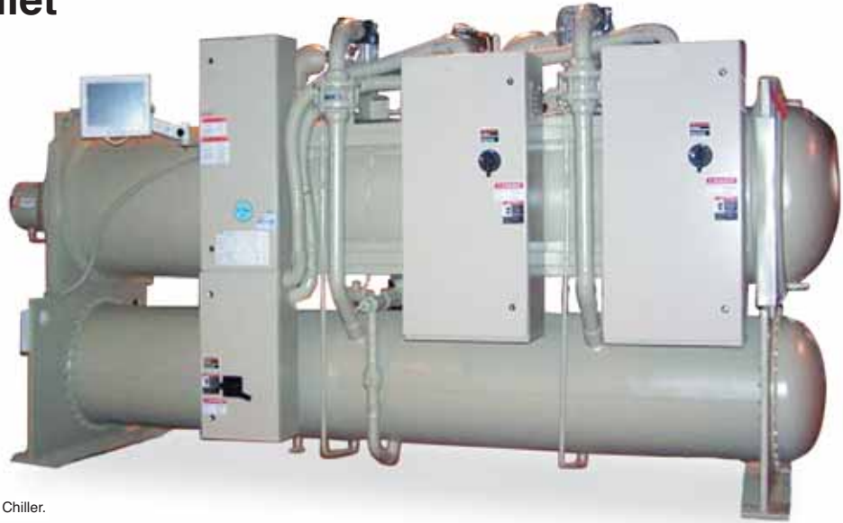
WMC Series Chiller.