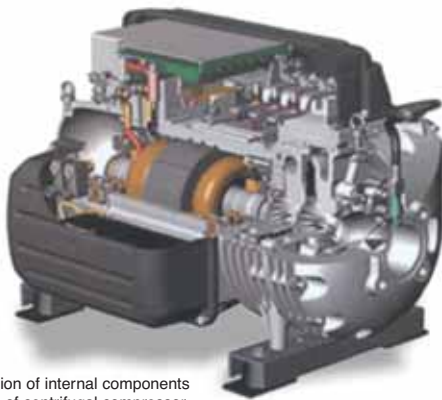
Illustration of internal components of centrifugal compressor.