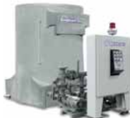
TTK-1600 pump tank station with polyethylene reservoir and optional Checkmate control and standby pump and manifold shown.

The WMC Series central chiller requires the use of a water circulation system to provide chilled water to process use points. The Advantage TTK Series pump tank station offers capacities to 300 tons with process pumps to 60 HP and evaporators pumps to 40 HP for total system balance and temperature control. Optional Checkmate control and standby pump and manifold are available.