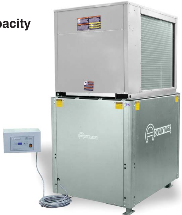
Illustration of D Series Package Chiller, 10 ton model shown.

if one of our standard models do not meet your process requirements, ADVANTAGE can design and build a unit that will! Ask about our popular “Tailor Made” package chillers.